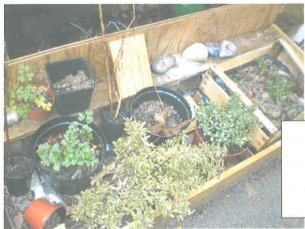
Little ones enjoy playing with the earth These herbs could probably survive up in the garden