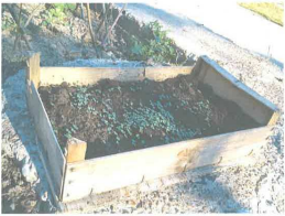
The Community Garden area at Hastings Adventure Playground and seeds coming to life in the garden